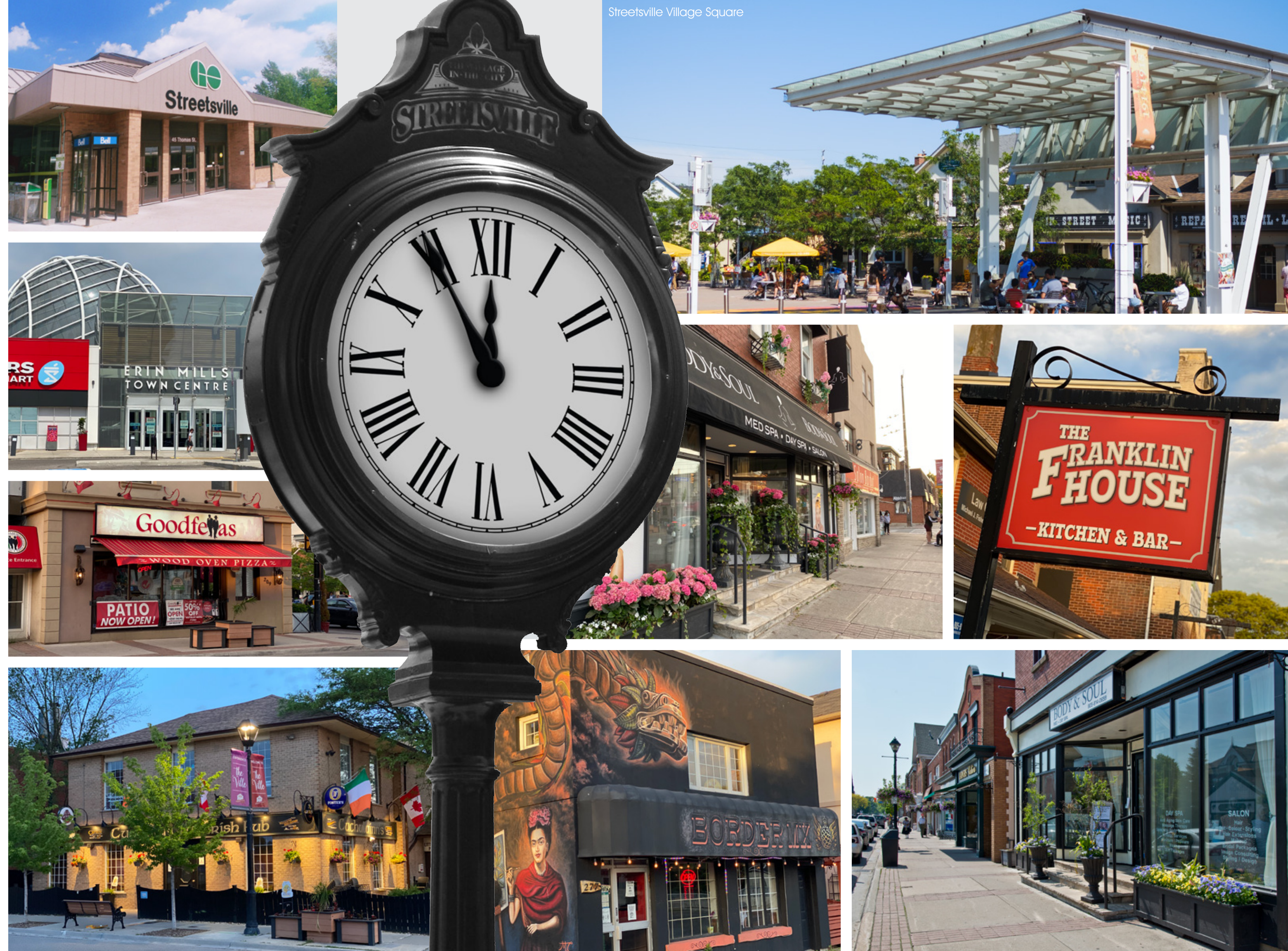
Streetsville Village Square

Pamper yourself at one of the many spas that pepper Queen and Main Street. Take a food tour of the town with a wide array of different types of restaurants, from classic Italian wood oven pizza to the fine dining that you would expect of a downtown restaurant. With so many choices for you to enjoy, your appetite will never want for variety and good food.