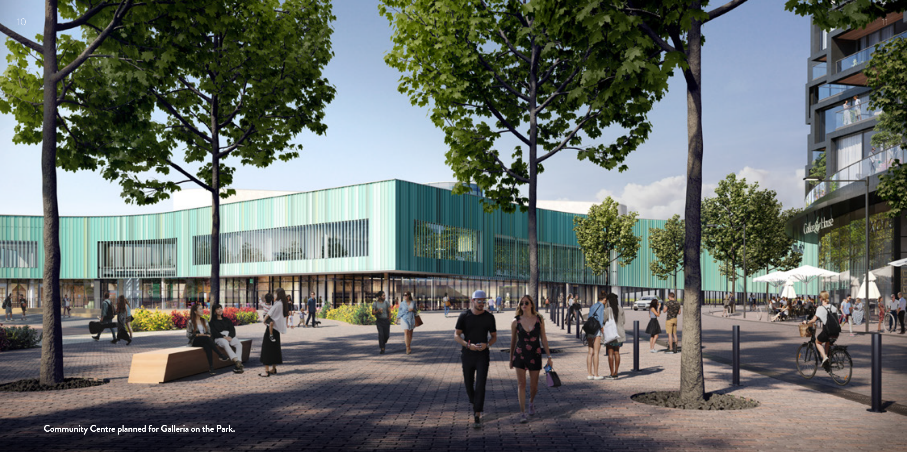
Community Centre planned for Galleria on the Park.