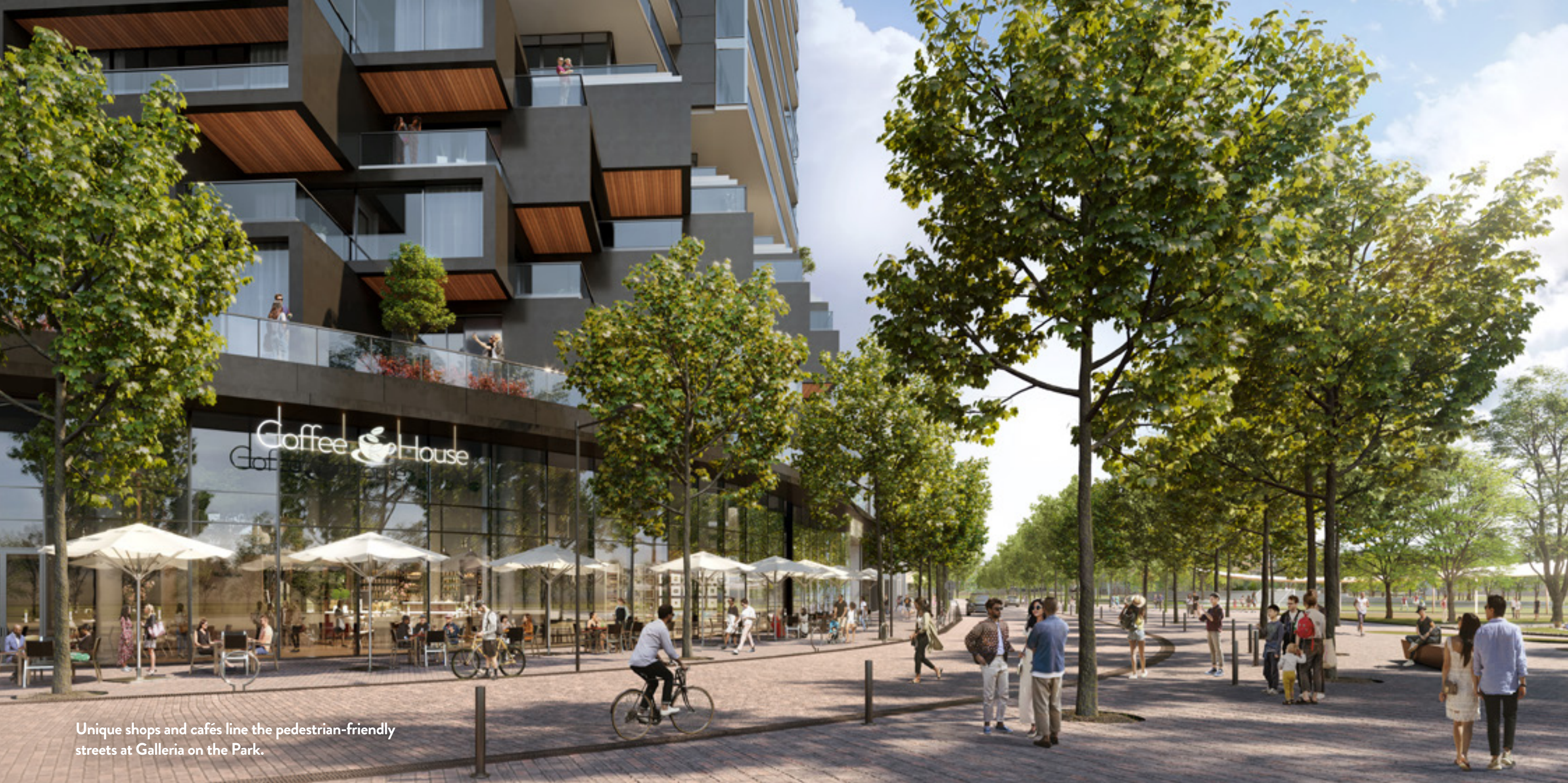
Unique shops and cafés line the pedestrian-friendly streets at Galleria on the Park.