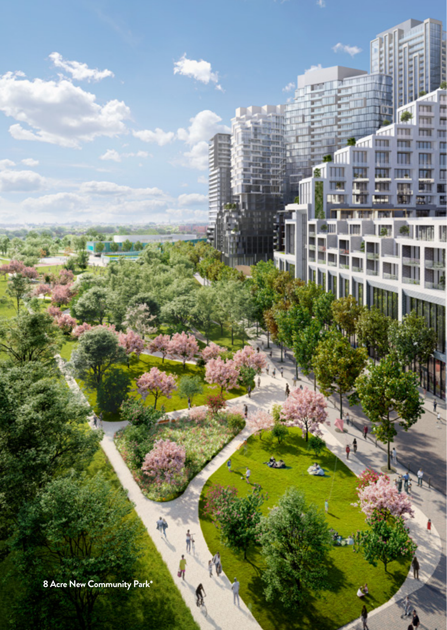
8 Acre New Community Park*

Always a green magnet for the neighbourhood, the existing Wallace Emerson Park will be expanded to eight acres, revitalized and redesigned to be even more enticing, and maximizing sunlight and south views of the Toronto skyline. The new design features three multi-functional spaces*: The Community Heart with a BMX/skateboard park, a multi-use sport court and skating pad, along with a skating trail; The Play Heart* , a multi-use green field with a hill that invites all Torontonians of all ages to gather and play; and The Nature Heart* with a treed canopy and meandering pathways for wandering and relaxing in a natural setting.