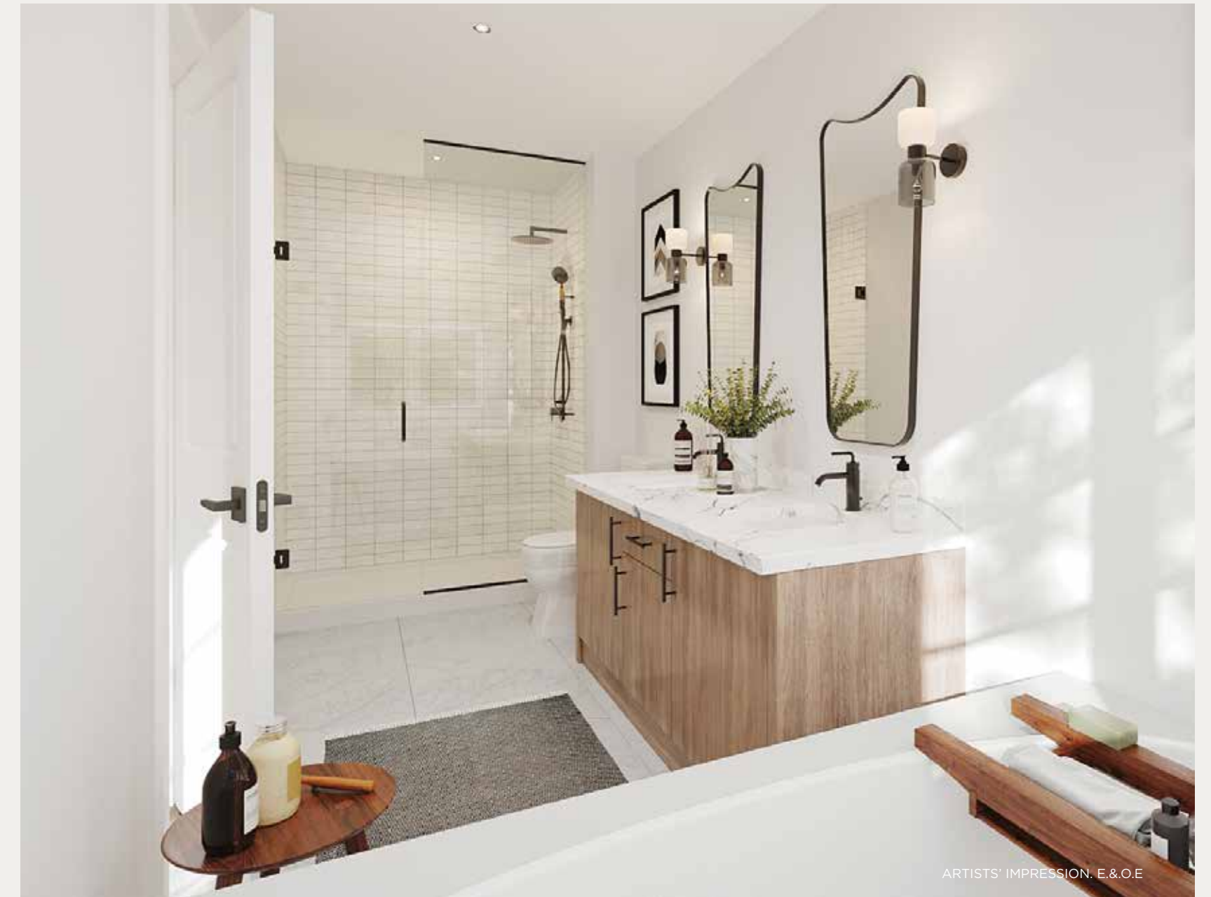
ARTISTS' IMPRESSION. E.&O.E

Choose from our impressive features & finishes and personalize your home your way.