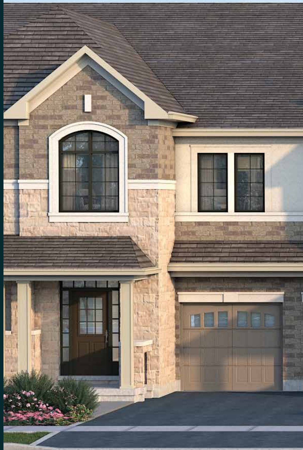
ARTISTS' IMPRESSION. E.&O.E