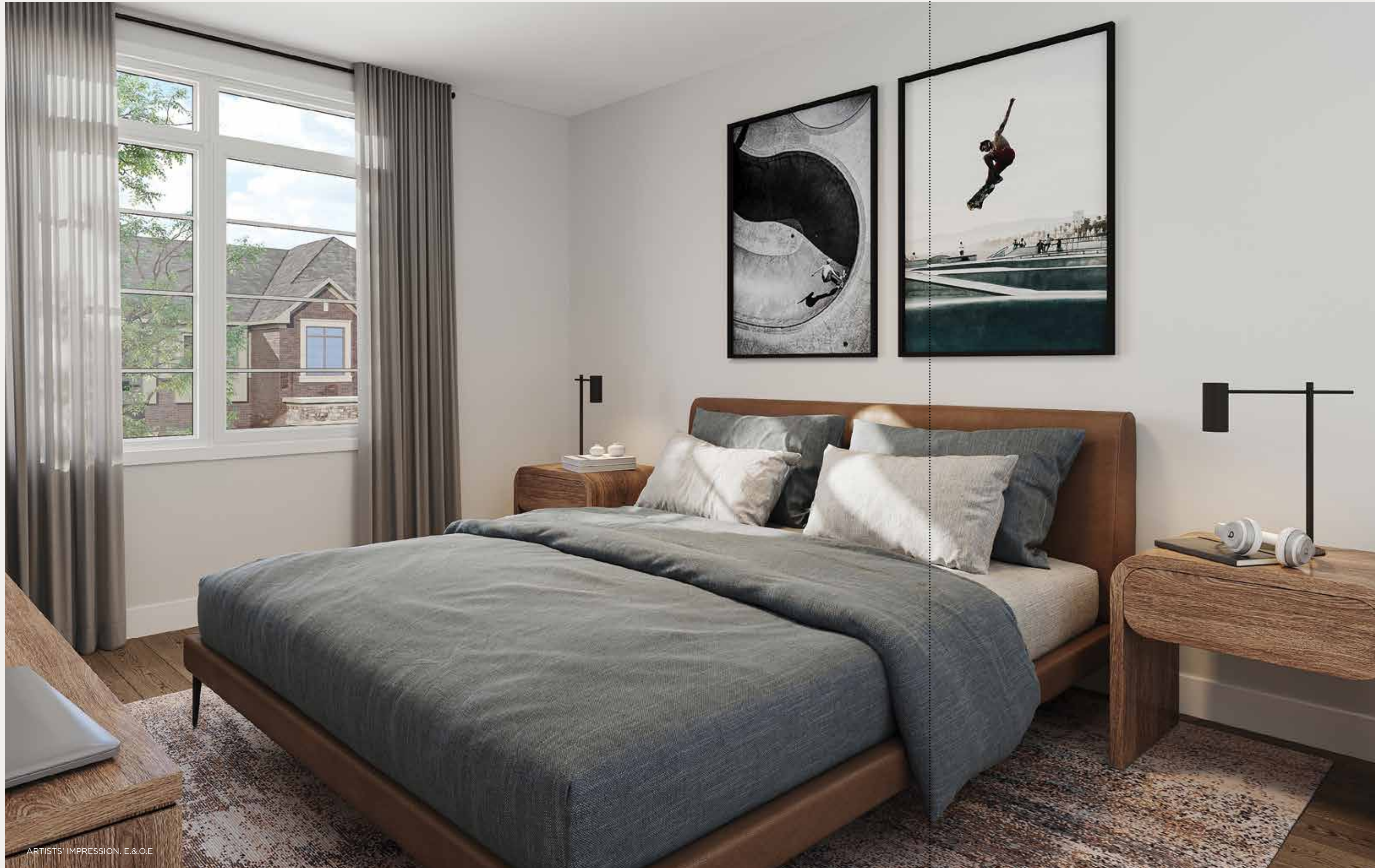
ARTISTS' IMPRESSION. E.&O.E

Each residence is a personal sanctuary of design with a commitment to style and elegance.