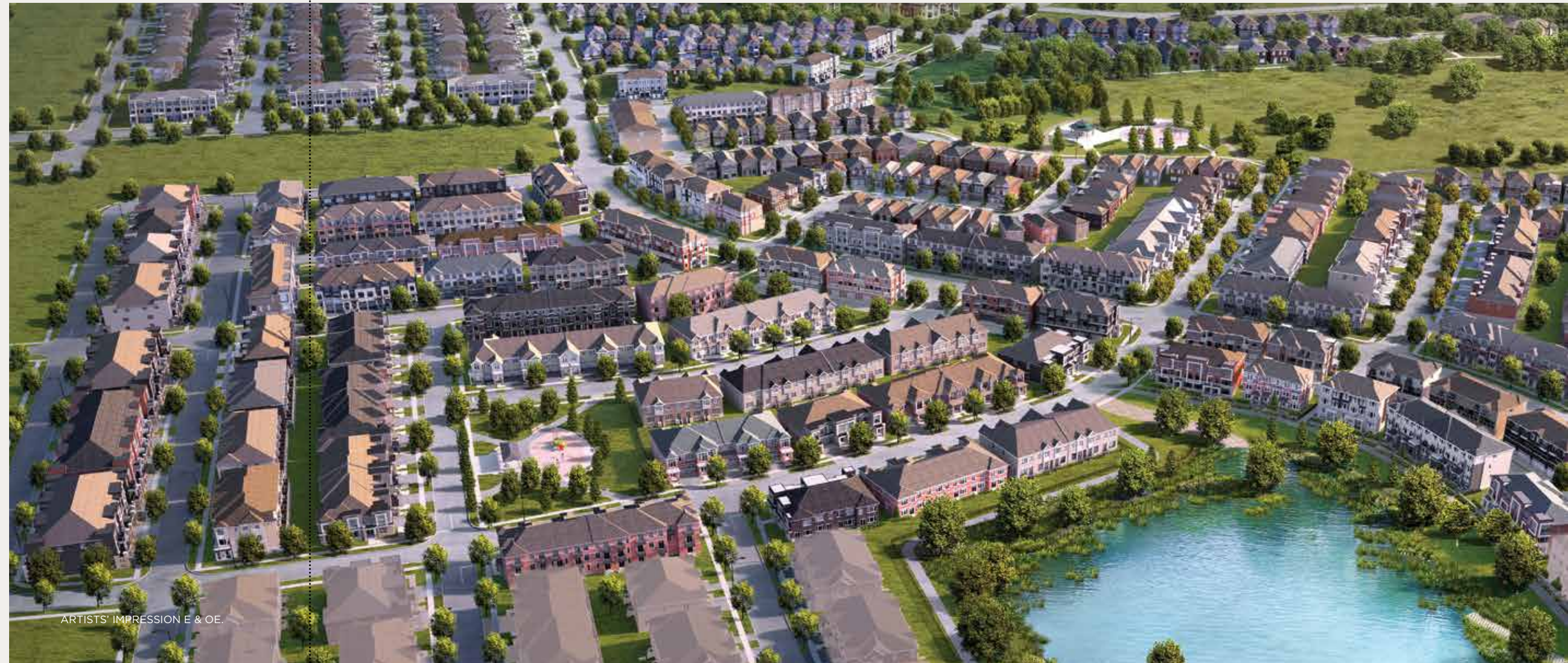
ARTISTS' IMPRESSION E & OE.

Experience the beauty of living a prestigious lifestyle in a thoughtfully curated master-planned community.