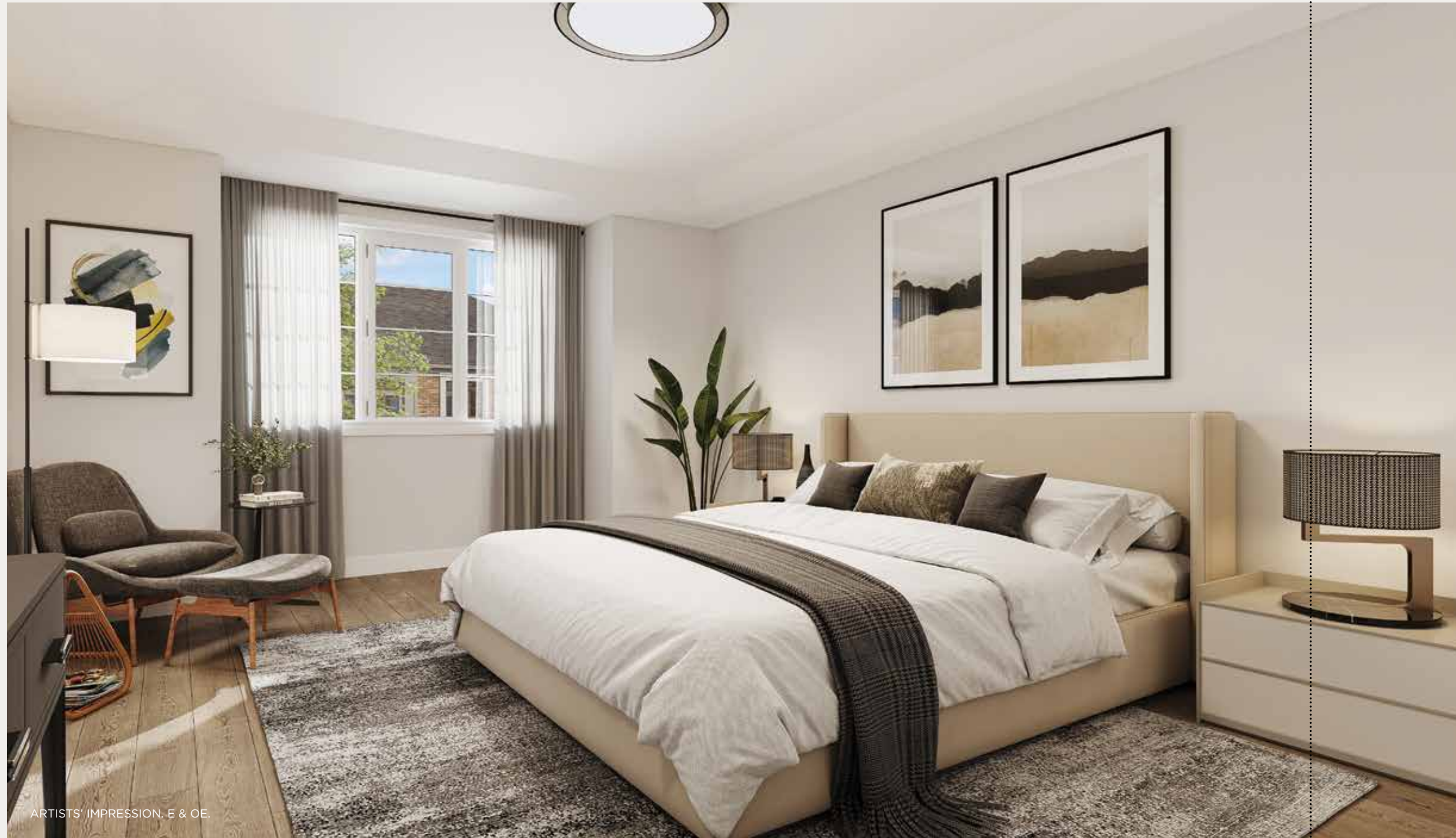
ARTISTS' IMPRESSION. E & OE.

From corner to corner, you will notice that quality and aesthetics go hand in hand to offer you a home that is exquisite, built to last, and always a pleasure to return to. Enjoy designer-selected finishes and the finest materials including state-of-the-art cabinetry, engineered hardwood flooring, quartz countertops, spa-inspired bathrooms and more.