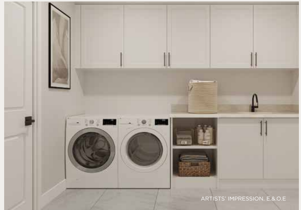
ARTISTS' IMPRESSION. E.&O.E

Each residence is a personal sanctuary of design with a commitment to style and elegance.