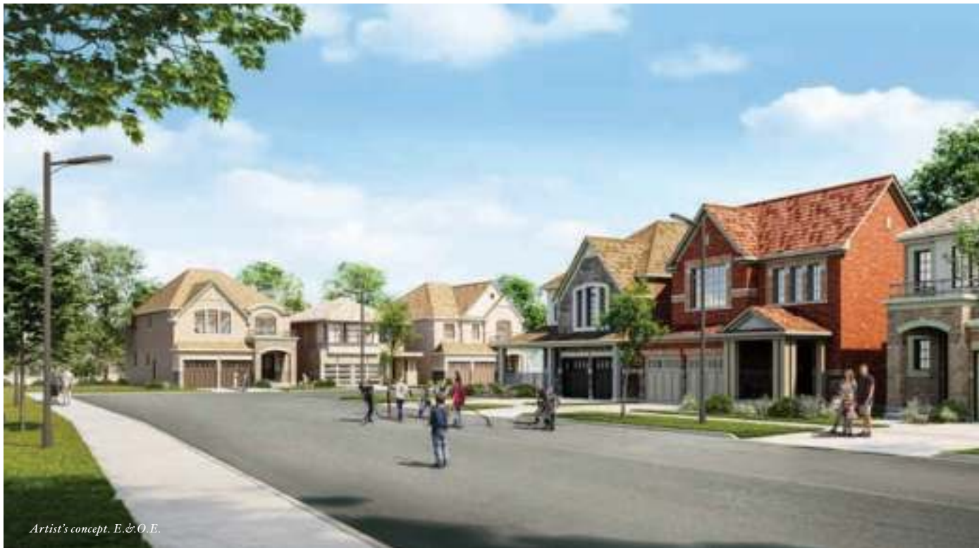
Artist's concept. E.&O.E.